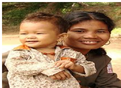
Figure 2: Mother and Child in Cambodia 9

A mother's love should never need to be earned by the child. The child should warrant the same without any restrictions. However, if this is not so, the child will experience a void in its heart all of their life. A mother's love should be unconditional, thereby laying the foundation of trust and emotional intimacy. If love is withheld, a child will search for it in million other ways, sometimes throughout their lifetime unless they come to some sort of peace with their past. The emotional foundation we bequeath our children at home helps establish their life. Therefore, the significance of home and the power of mother's love 8 should always be valued.