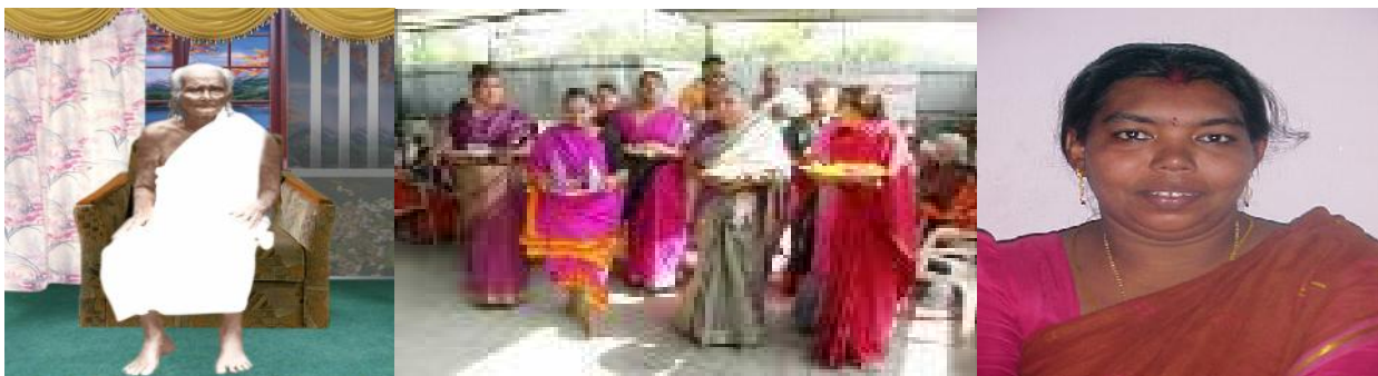
Figure 8: Mothers

Empowerment is the only way to enable our mothers to improve their position and better control their resources and bring change in the age-old ideas. Empowerment is a multidimensional process facilitating individuals and or a group of individuals to appreciate their full potential in all aspects of life. Caught in the changing scenario of globalization, the time to question whether the trend of feminism will hold or not 23 . Are mothers moving toward empowerment or are becoming trapped in a wider web? However, some important factors that account for evaluating mothers' empowerment are male-to-female ratio, literacy, population of women, age of marriage, mothers' health status, and so on.