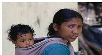
Figure 4: Sikkimese Mother with Child 15

The social roles associated with motherhood are variable across time, culture, and social class 13 . Historically, the role of women was limited to a large extent to being a mother and a wife, with women being expected to dedicate most of their energy to these roles, and to spend most of their time taking care of the home. In many cultures, it was the standard norm to receive assistance from the older female relatives, such as mothers-in-law or their own mothers. 14